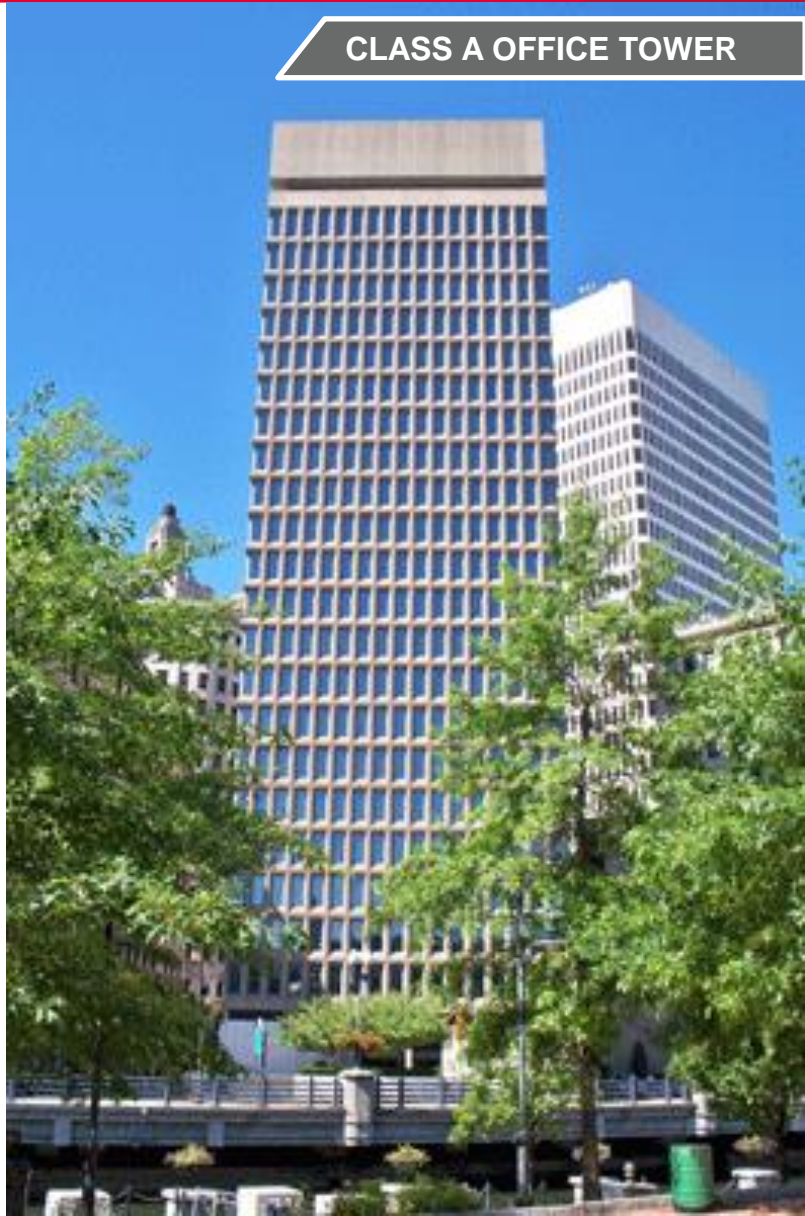
CLASS A OFFICE TOWER