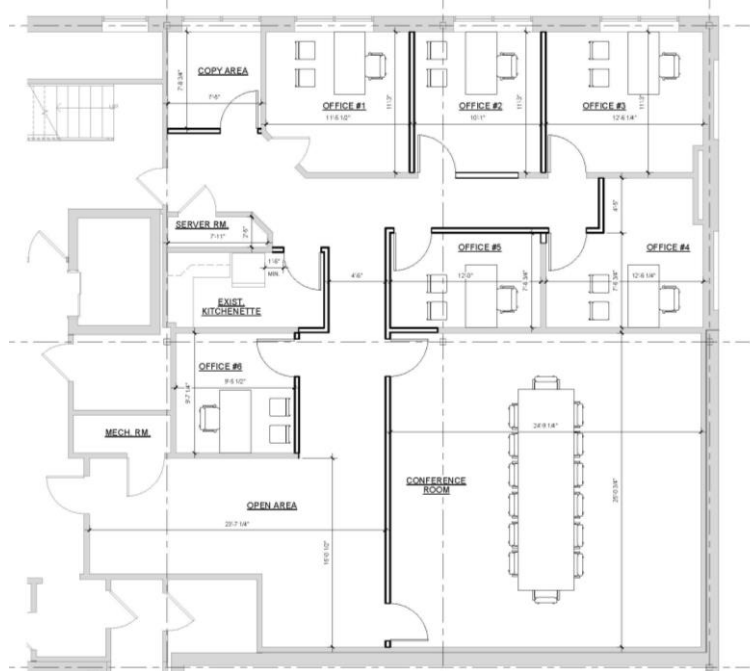
Lower-Level Test Fit Plan