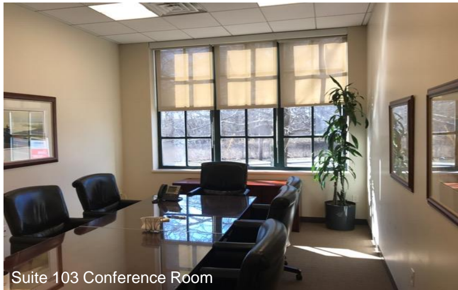
Suite 103 Conference Room