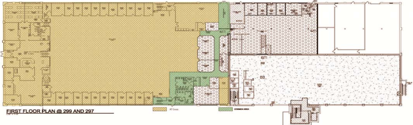
FIRST FLOOR PLAN @ 299 AND 297