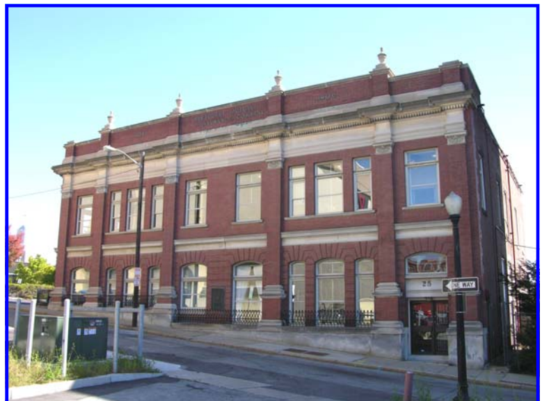
25 Maple Street