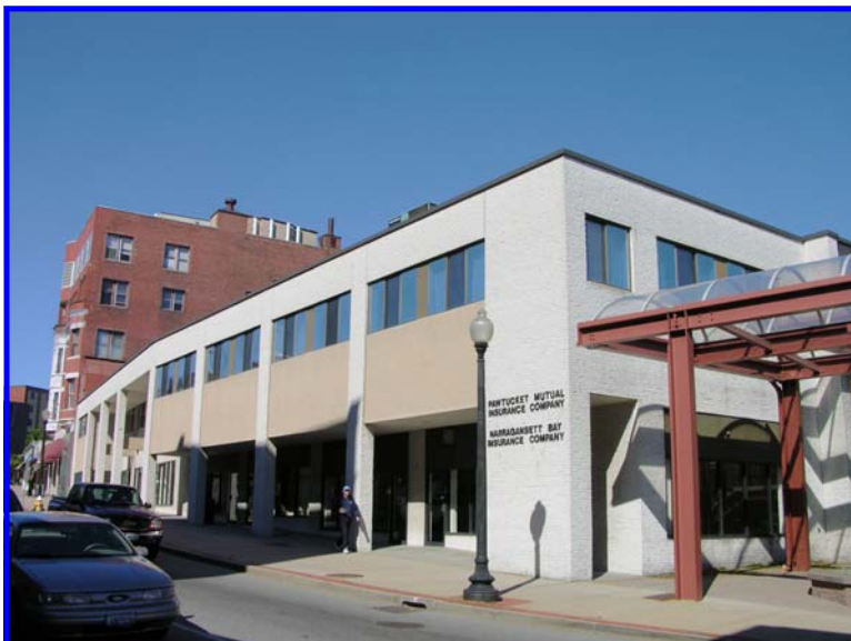
217-235 Main Street